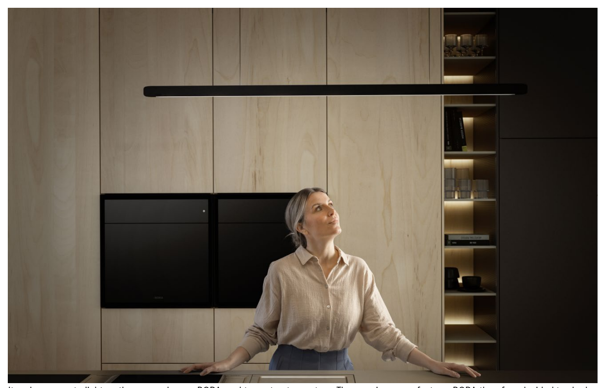
It makes sense to light up the space above a BORA cooktop extractor system. The premium manufacturer BORA therefore decided to shed some light on the matter and launch two pendant lights on the kitchen retail market.

With BORA Horizon and BORA Stars, the German-Austrian company group is expanding its range of premium built-in kitchen appliances to include lighting solutions. Whether fitted above worktops, cooktops or dining tables, various models of the BORA Horizon horizontal pendant light and the BORA Stars vertical pendant light create the perfect lighting for every situation and blend discreetly into the overall kitchen environment, adding a touch of refinement. Both lights are available in three colours.