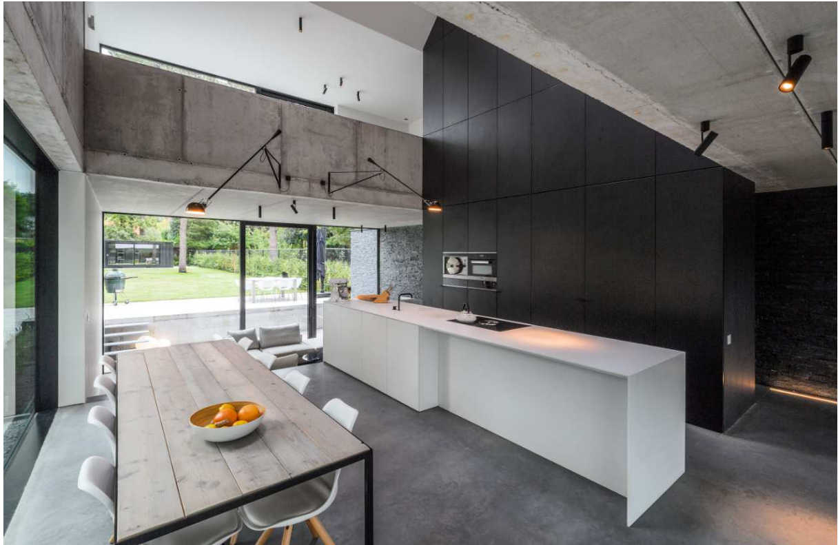
BORA Basic takes centre stage in the kitchen area, blending in to its surroundings.

The major benefit: no extractor hood at head height! The chef has a clear view of the dining area at all times and can chat to his guests while cooking.