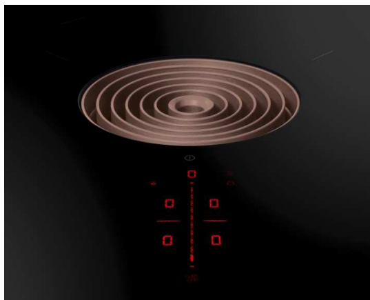
BORA Pure: the air inlet nozzle in six colours is a real eye-catcher

Scaled down to the bare essentials, this striking design element is bound to win you over: The air inlet nozzle is available in six different colours, meaning that the consumer can get creative. With this impressive eye-catcher in the centre, they can add an individual touch to their home. In this way, personal taste can be integrated into every kitchen environment.