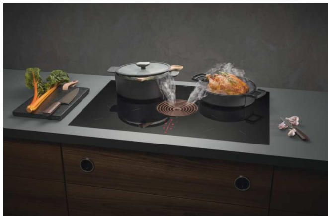
A class of its own – for every kitchen

Another functional highlight is the automatic extractor control: the extractor power level automatically adjusts itself depending on current cooking behaviour. This leaves more time for cooking as it is no longer necessary to waste time manually adjusting the extractor.