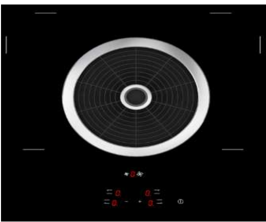
Sleek and elegant: The BORA Basic design

Thanks to new technology, the radiant heating element (HiLight) with 3,000 watts, has far more power and achieves optimum cooking results far quicker than conventional radiant heating elements: The heating time is reduced by 30 percent. With a Hyper level, automatic heat-up function and heat retention function, the system enables optimally tailored heating performance. The extensive technical features include a timer function, residual heat display, touch controls, automatic after-run and a filter service display.