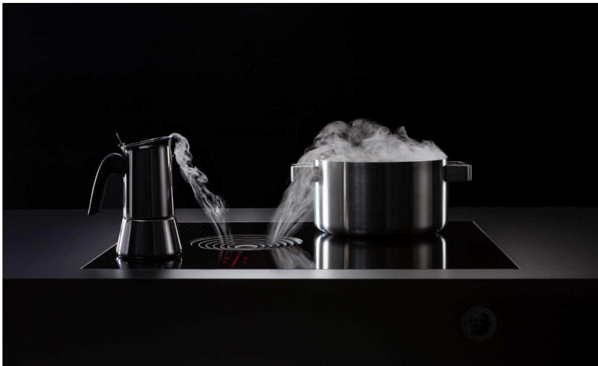
BORA S Pure: the latest compact version of the high-performance induction system.

Raubling. BORA Lüftungstechnik GmbH, manufacturer of innovative cooktop extractors, is launching a solution for small kitchens: the new BORA S Pure rounds off the range of BORA Pure compact appliances. It not only features an elegant design true to the “form follows function” motto, but it also delivers top performance with optimum cooktop use.