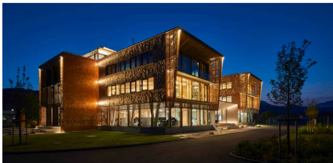
New BORA building at the Niederndorf site