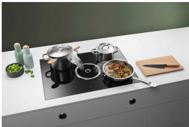
BORA Basic: Cooktop extractor as a compact system

Two fans within the cooktop work almost silently and in parallel. BORA Basic can be easily installed in any kitchen and is instantly ready for use, looks great and is easy to operate. The moving parts of the cooktop extractor can be easily dismantled, enabling quick and easy cleaning. The air inlet nozzle and stainless steel grease filter are even dishwasher safe. An indicator on the central touchscreen display notifies users if the activated charcoal filter in the recirculating air system needs to be changed.